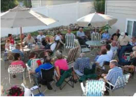
Some of the 41 members attending