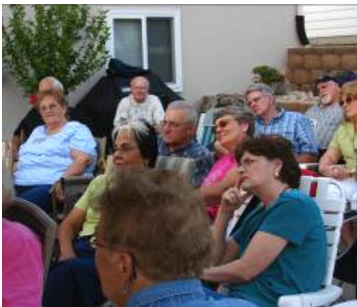
Members getting updates during the meeting