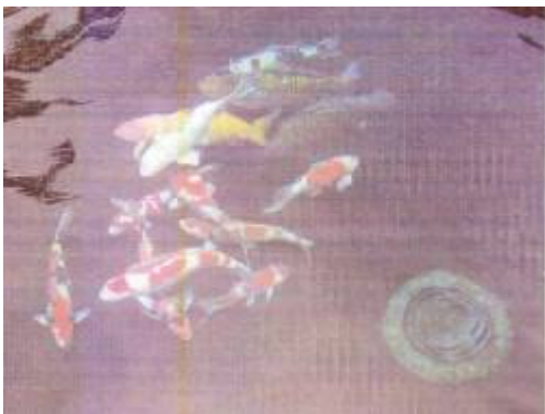
Can you see the wrench—15 feet down on the drain?

Next years' seminars are moving to February and are in San Diego, CA. Won't you join us next year?